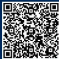
Grade 5/6 Information Night

Use the following QR Codes to make your bookings-