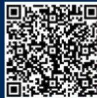
School Tour Bookings